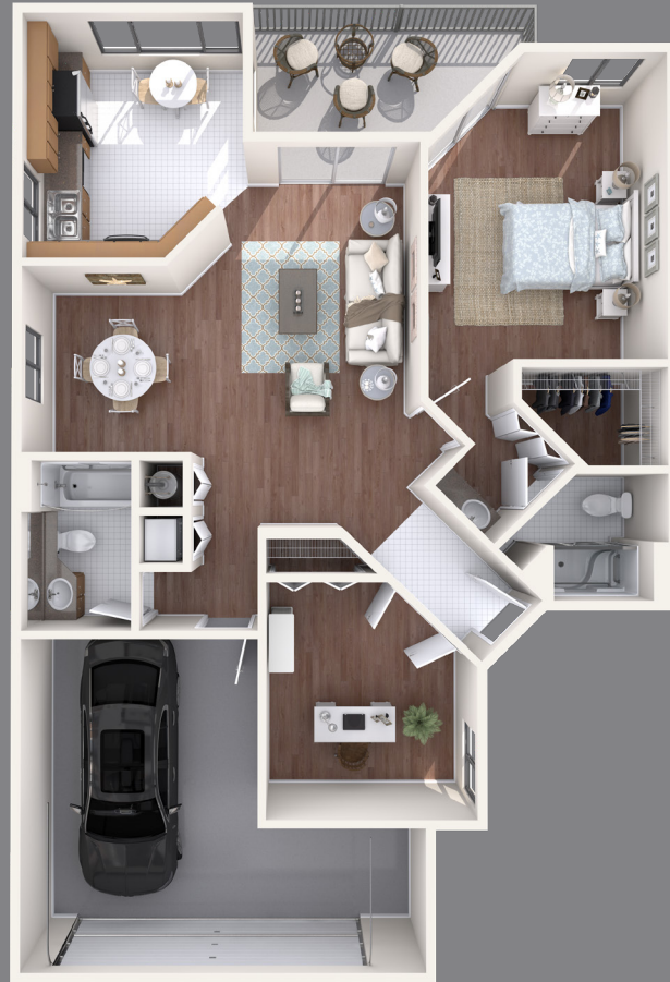
COASTAL 2 Bed, 2 Bath Approximately 1,200 sq. ft.