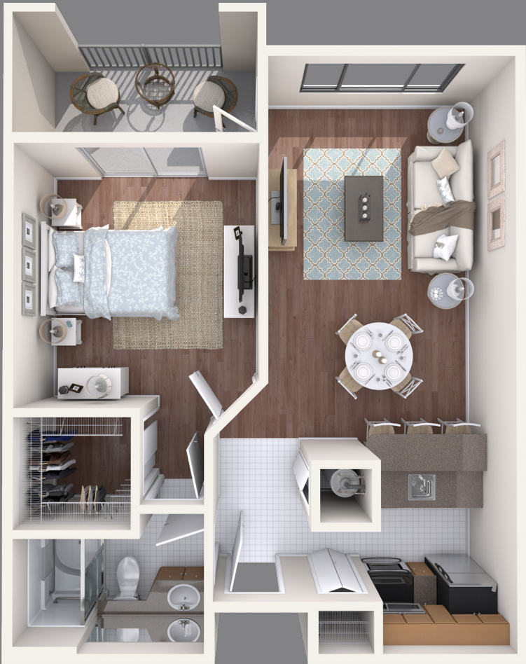
OCEAN BREEZE Deluxe 1 Bed, 1 Bath Approximately 775 sq. ft.