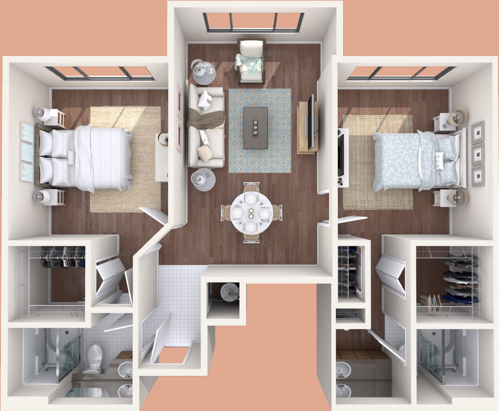
SEASIDE Shared 2 Bed, 2 Bath