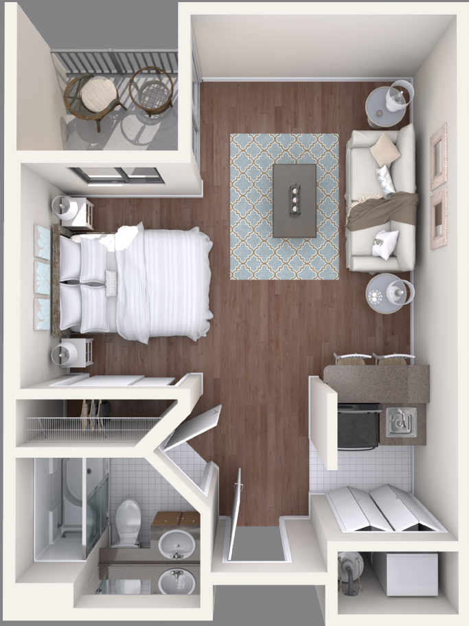
TIDEWATER Studio, 1 Bath Approximately 380 sq. ft.