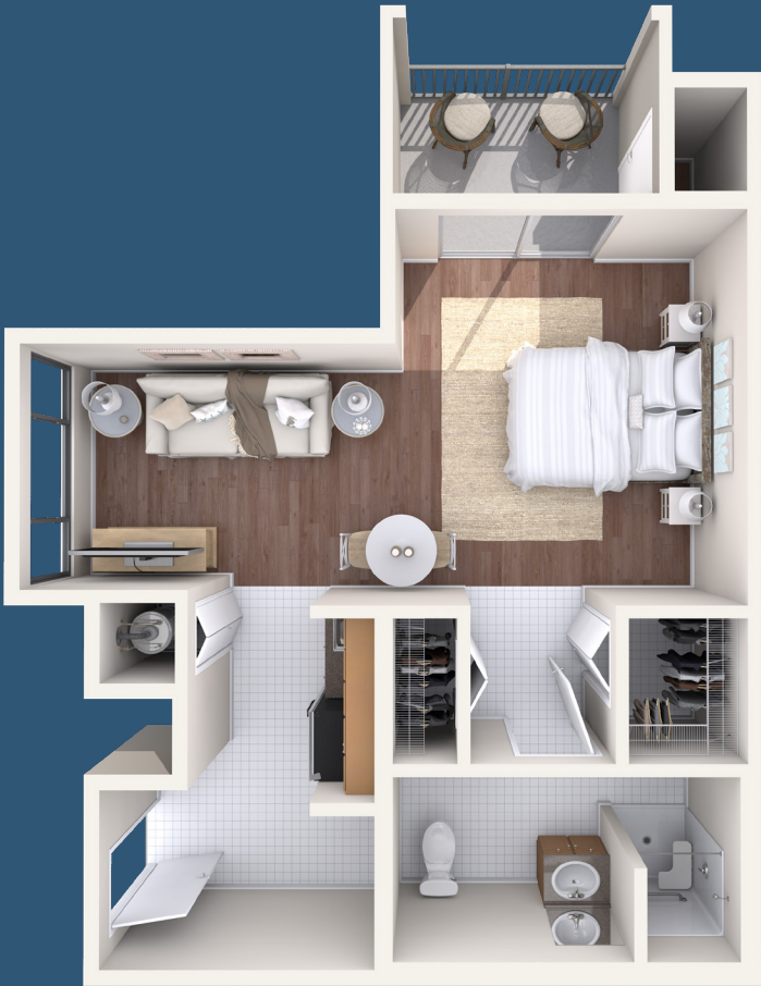
SEA TURTLE Deluxe Studio, 1 Bath Approximately 600 sq. ft.