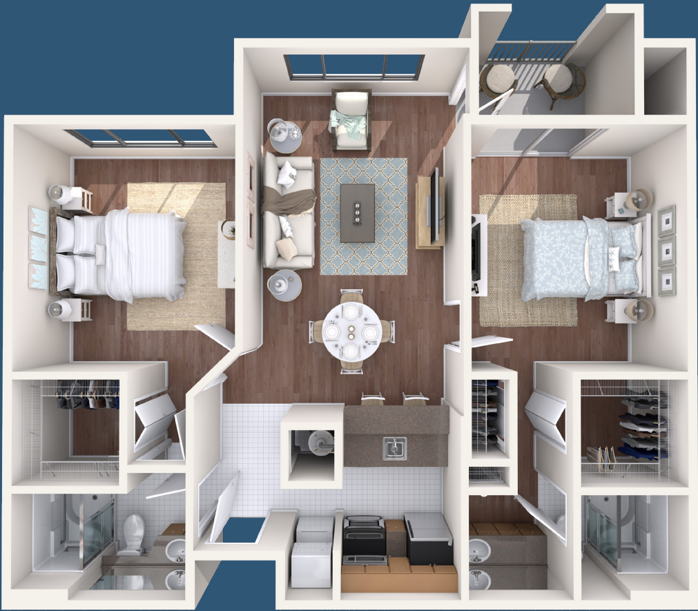
WINDWARD 2 Bed, 2 Bath Approximately 1,015 sq. ft.