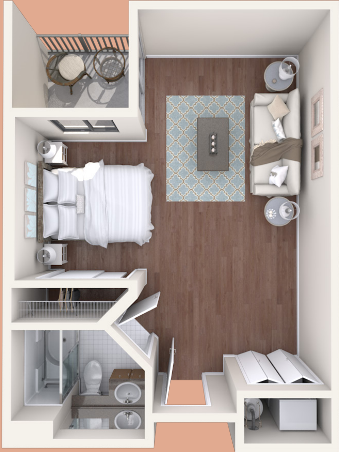
EVERGLADE Studio, 1 Bath