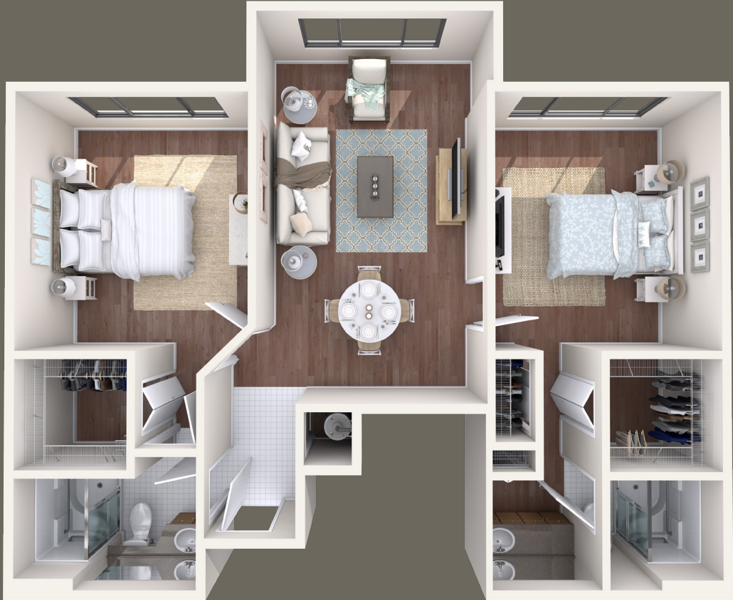
SEASIDE Shared 2 Bed, 2 Bath