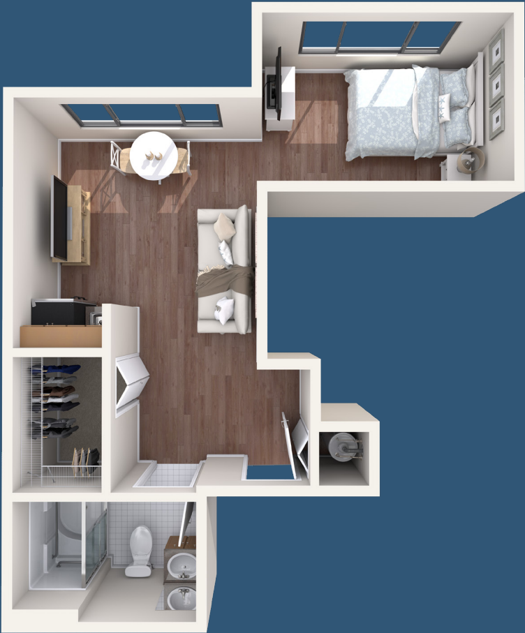
SANDBAR 1 Bed, 1 Bath Approximately 430 sq. ft.