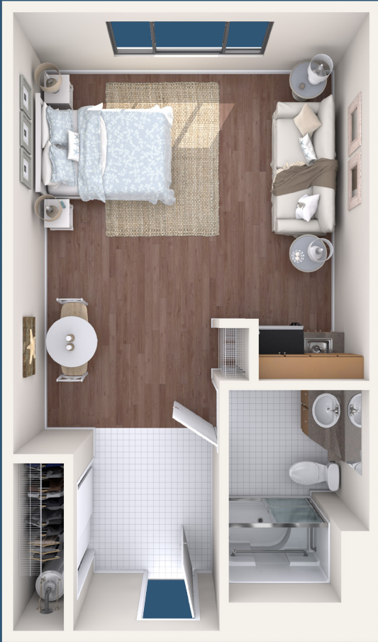
EVERGLADE Studio, 1 Bath Approximately 255 sq. ft.