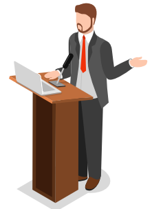
Lectures and Continuing Ed Classes